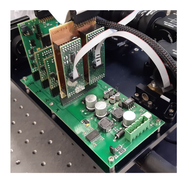
Obr. 1: Stabilization unit (left) and control electronics (right).